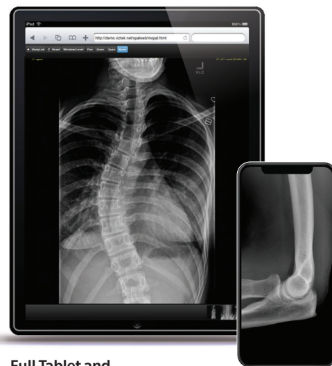
Full Tablet and Smartphone Access

Symmetry Mini PACS will integrate seamlessly with electronic health record (EHR) applications to import full patient demographic information, eliminating duplicate data input. Additionally, images from completed exams are available to view within the EHR. (Requires additional fee)